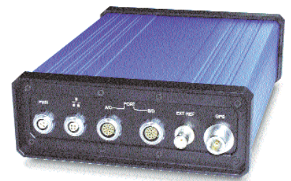
iCGRS back panel

You can easily program recording sessions through a browser window.